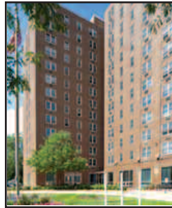
SCHNEIDER APARTMENT SENIOR HOUSING